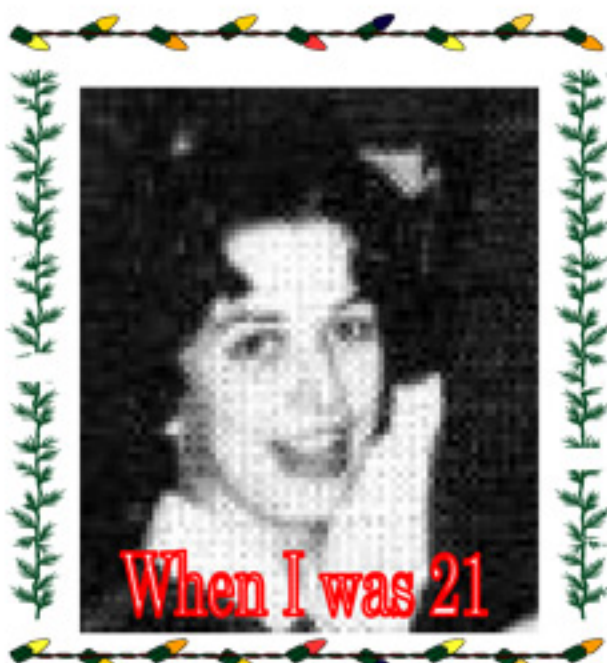
Brian's Sausage Bean Soup